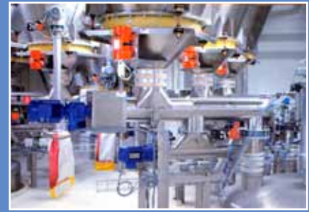
Bin activators and precision screw feeders