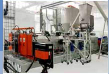
Micro-batch feeders on top of extruder