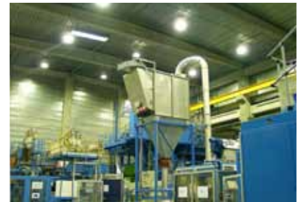
Dust collector in car tank factory

063002150 May 2011 Rights reserved to modify technical specifications.