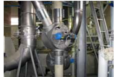
Drum-type diverter valve in pneumatic conveying system